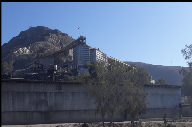
PUNITAQUI MINE COMPLEX